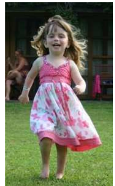
Now 5 years old